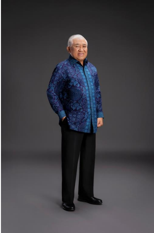
Prof. DR. H.M. Sirajuddin Syamsuddin, MA Chairman of Sharia Supervisory Board

Indonesian citizen. Age 64. Domiciled in Indonesia. He has been serving as Chairman of Syariah Supervisory Board, Syariah Business Unit PT Bank Danamon Indonesia Tbk since 2002 and reappointed with the same position in the Annual General Meeting of Shareholders on 23 March 2020.